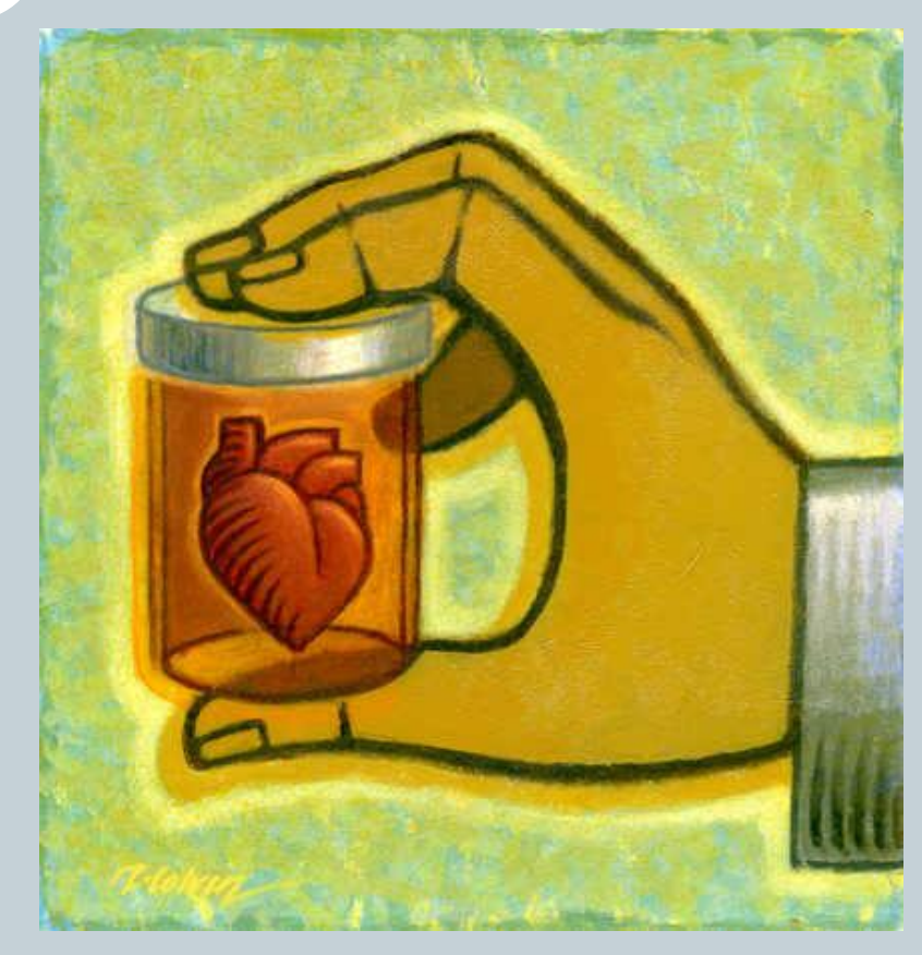
"A good tester has the heart of a developer... ...in a jar, on their desk."